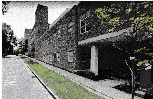
Mt. Vernon Av looking South (Uphill)

Based on the above, we request that zoning code be revised to make the existing window lines on Mt. Vernon Ave become a requirement of future development. We also ask that this requirement be extended to any building on Rockingham St. Our suggestion is to consider language similar to that found in existing CCD code: